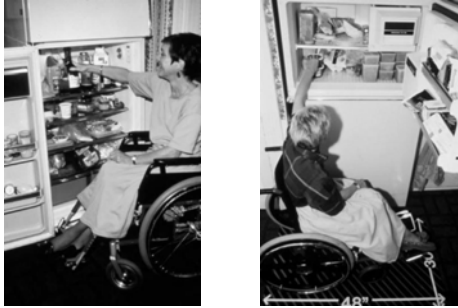
Refrigerator and Freezer Space