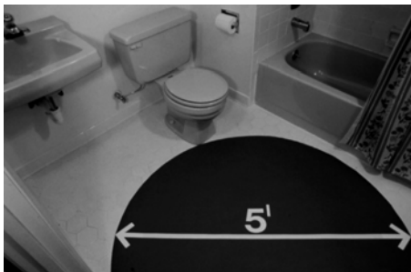
Turning Space in All Spaces