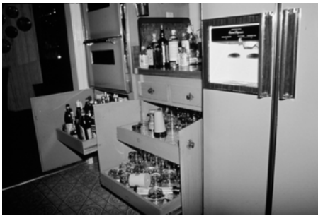
50 % of Self Space in Kitchen Storage