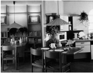
Living and Dining Areas