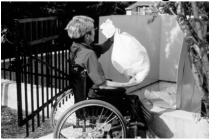
Trash Disposal Areas